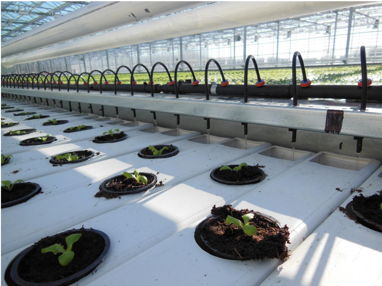
Irrigation into the gutters

Drip emitters adjust the water to the gutters, so the lettuce gets the same amount of water.