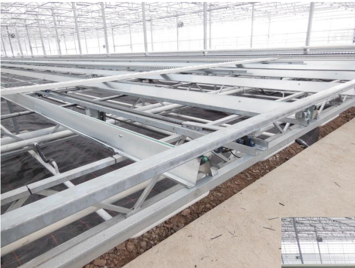
Inlet pushing system ready for loading

The barrier pushes a gutter into the gutter line each time a gutter are taken out at the outlet end.