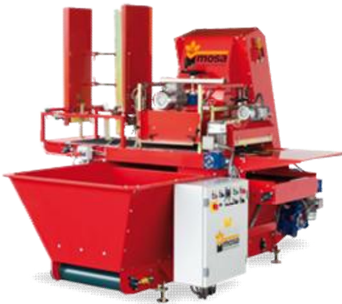
Soil filling machine