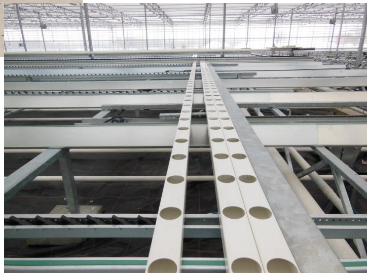
Inlet pushing system ready for pushing gutters into line