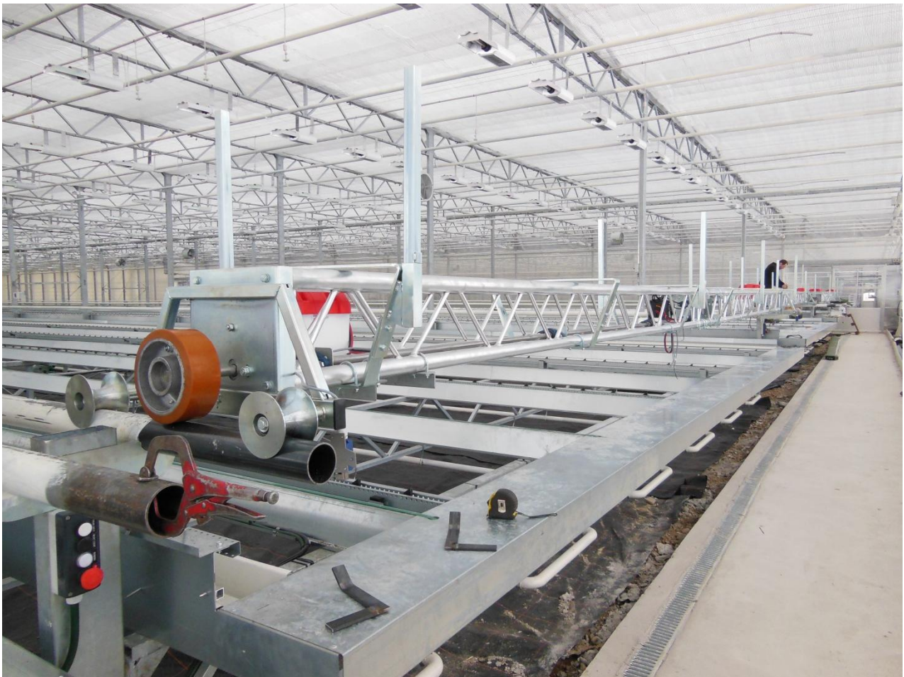
Automatic gutter trolley

Transportation of the emptied and washed gutters is done by trolleys running on pipes over the gutter lines. The transport trolleys are made as wireless automatic trolleys who transport the gutters to inlet end when start button are pressed or as manual trolley where a person has to walk with the trolley to inlet end.