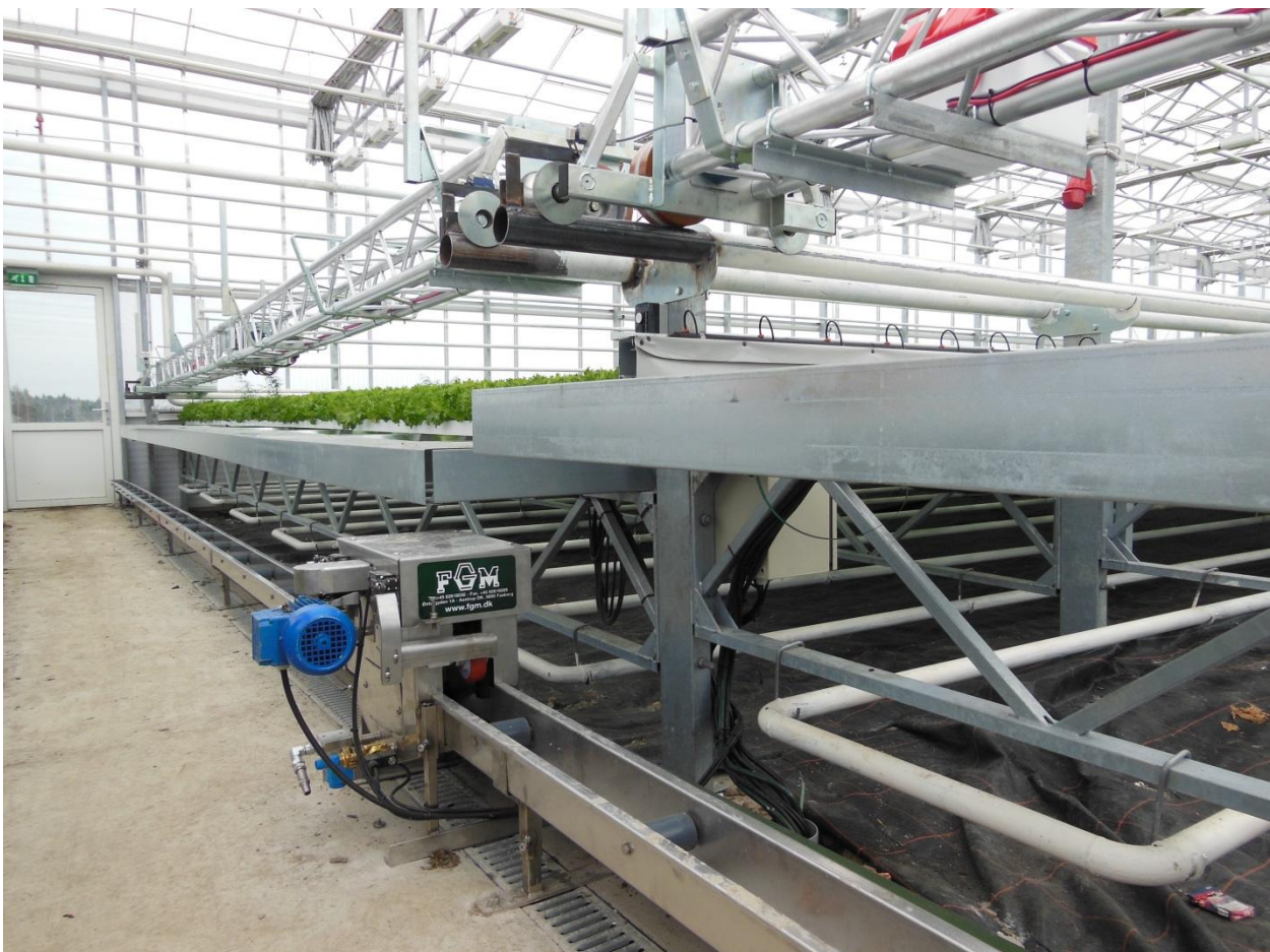
Gutter Washing machine with roller benches

Gutter washing machines are placed between two gutter lines. When a gutter are placed at inlet/outlet it runs into the washing machine where cleaning liquid are sprayed with high pressure onto the gutter, when the gutter has gone through the washer, it returns while water are sprayed with high pressure to remove the dirt and cleaning liquid.