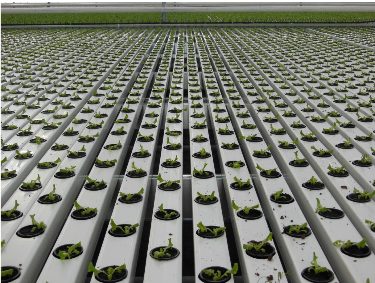
Gutters in the Gutter line

With the automatic gutter system, the distance between the gutters is adapted to the size of the Lettuce. When the Lettuce are little, at the inlet end of the Gutter line, the distance between the gutters are 0,5 cm. As the gutters are moved towards the outlet, the distance between the gutters is decreased as the lettuce are getting bigger.